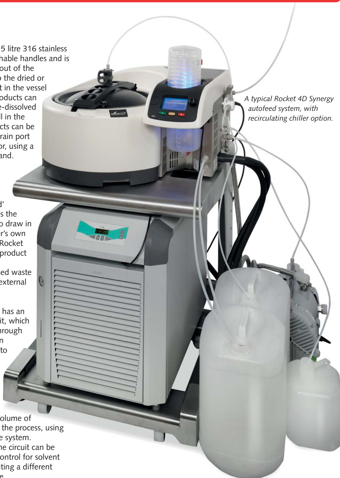
A typical Rocket 4D Synergy autofeed system, with recirculating chiller option.

Cleaning the Rocket 4D Synergy between cycles is very straightforward. The PTFE feed tubing is easily detached for cleaning or replacement and the vessel can be readily cleaned, wiped, inspected and even put in a dishwasher. It's all so easy compared with handling large glass evaporator flasks!